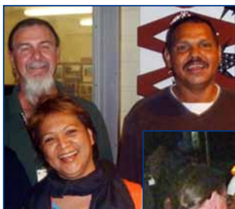
Above & Right: Domestic Violence Awareness week events on Palm Island included a memorial service for victims

The Plan was developed to: improve the level and quality of Queensland Health service delivery to Palm Island people; increase access to Palm Island health services; and, enhance the involvement of Palm Island people in the design and delivery of Queensland Health provided services. The success of the Plan requires a strong partnership between community members and representatives, service providers and governments.