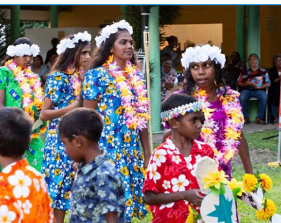
Yarrabah's own Morning Star Dancers at the Jabu Birriny (land + sea) Cultural Festival last month.