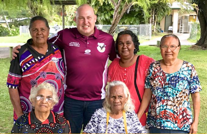
ABOVE: Some good news! Local MP Curtis Pitt met with the Elders group to discuss upgrades – including for the Elders Hub – around the community - see page 2 for full story!