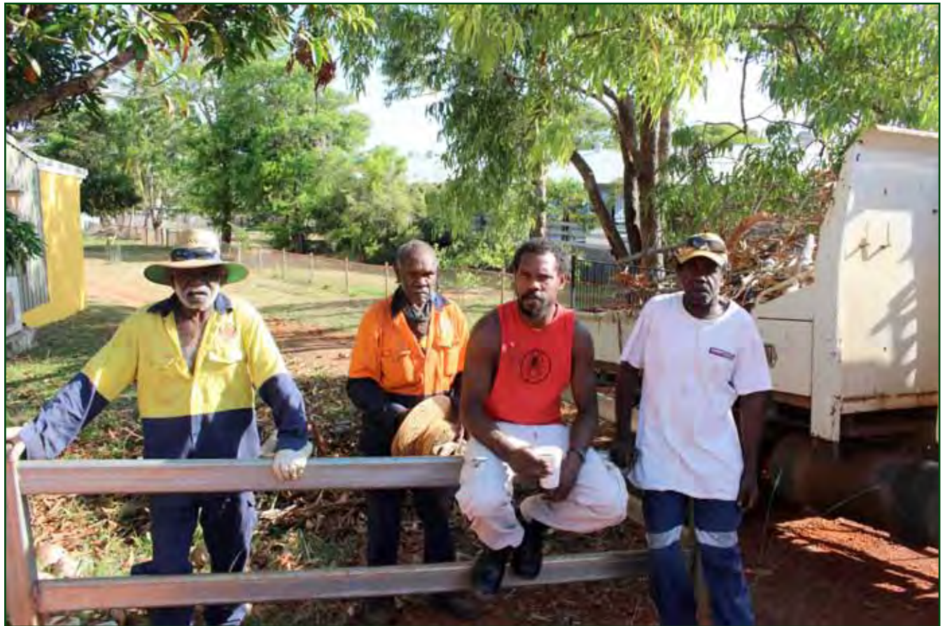
ABOVE: The Lockhart River Aboriginal Shire Council Parks & Gardens Crew