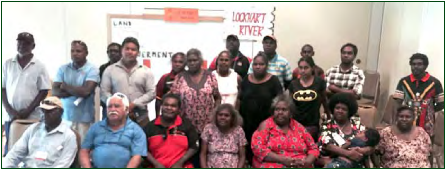
The Lockhart River sub-regional discussion group at the Cape York Agenda 2.0 Summit at Palm Cove, Cairns