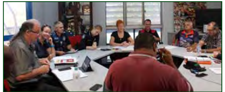
ABOVE: In September this year all staff supervisors attended Disaster Management workshops in preparation for this year's wet season, which is expected to bring at least one cyclone to the region.