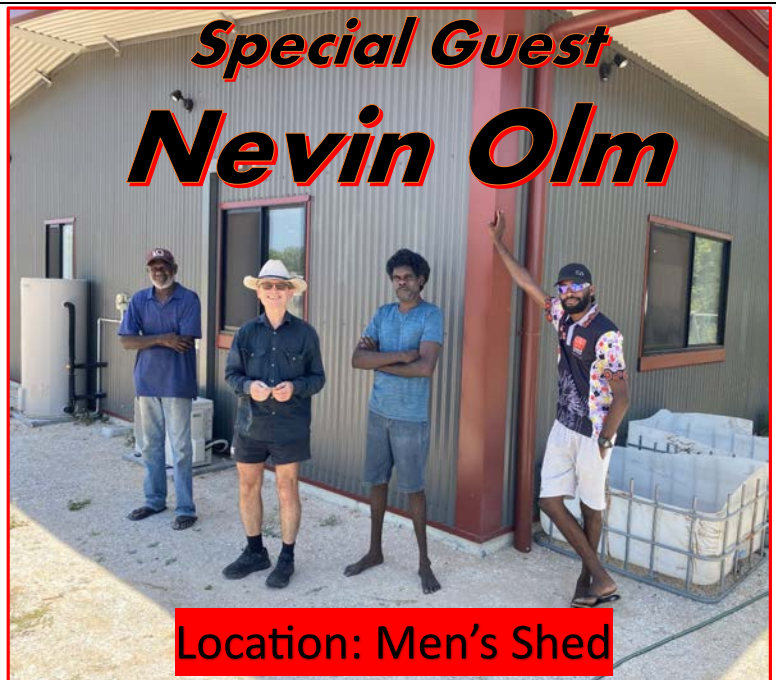
Location: Men's Shed

This is an invitation for all men to come and join us at the Men's Shed for lunch and a yarn.