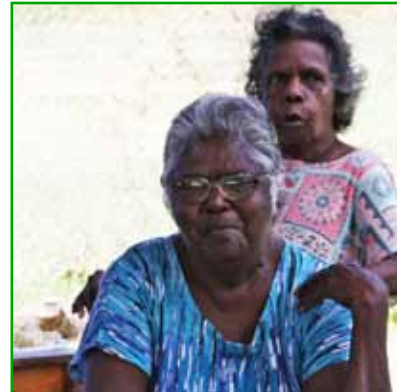
Above: Elders, families and children at the kindy's NAIDOC lunch