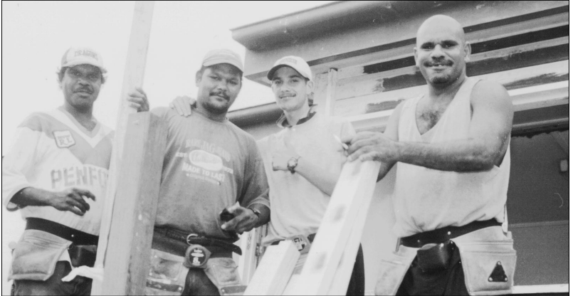
Much of the construction work around Cherbourg is in renovation - here is another group of workers extending a back deck

"But with the new shed, better facilities and more staff we hope to go back out on the road a little bit to hopefully bring some more money into the community."